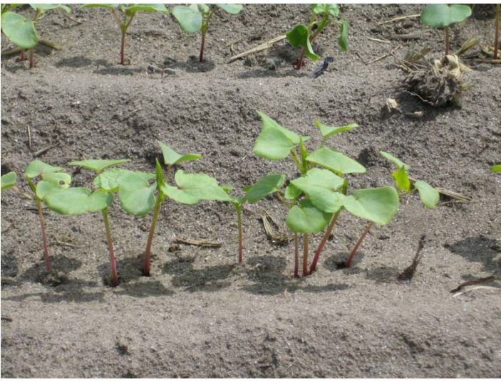
Figure 5. Young seedlings of buckwheat in Citra, Florida. This buckwheat was seeded with a drill at a rate of 50 lbs/acre (56 kg/ha.)

The dense, fibrous root system is concentrated in the top 25 cm (10 in) of the soil, and may perform better than cereal grains on low-fertility soils due in part to its root morphology (Bowman et al., 1998). The short taproot and its branches account for 3% to 8% of the dry weight of the plant (Robinson, 1980). The percent of dry weight is much less than the root system of small grains, which may comprise 6% to 15% of the total weight of the plant. Because of its small size, the root system acquires water from a limited volume of soil, which may be a partial explanation for wilting that occurs in hot, dry weather. It is planted in the northeastern states and Canada in the summer, and