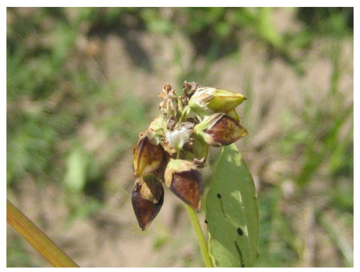
Figure 6. Six week old buckwheat in seed in Citra, Florida. in the southeastern U.S., it is typically planted in the early spring or fall.

Buckwheat produces a single stalk per seed and branching depends on seeding. Plants will develop more branches per plant in thin stands; thick stands result in less branching and lower stalk diameter, and are susceptible to lodging (Robinson, 1980). Because of its short life cycle, buckwheat can be included in rotations between cash crops. The unbranched basal stem is hollow in the center, and once incorporated into the soil decomposes rapidly, providing nutrients to the subsequent crop. Due to its rapid decomposition, it may not be suitable as surface mulch on erodible soils.