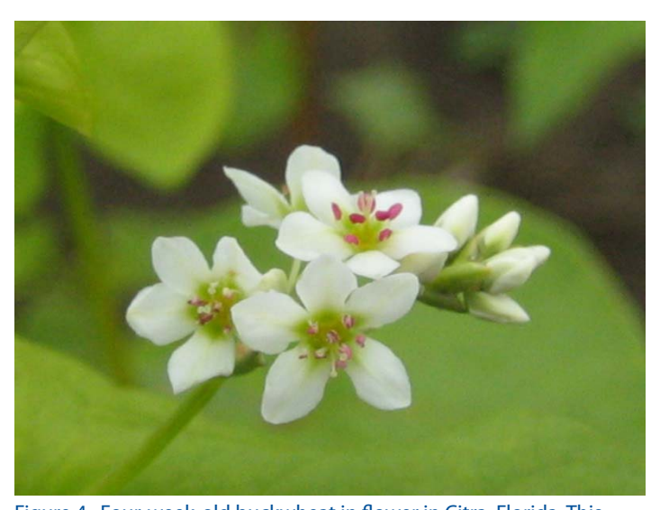
Figure 4. Four-week-old buckwheat in flower in Citra, Florida. This buckwheat was planted on March 13.

approximately three to five weeks. In ongoing experiments on buckwheat as a weed-suppressive cover crop in Citra, Florida, flowers appeared in three weeks in late spring, and four weeks in the fall (Huang, unpublished data). In those same experiments, mature seeds formed in six weeks in late spring, and eight weeks in the fall (Huang, unpublished data) (Figure 6). The crop requires 12 weeks to harvest mature seed. Buckwheat is tolerant of a wide range of soil types and fertility levels, but performs best when the climate is cool and moist. It germinates at temperatures between 7° and 40°C (45 – 104°F). It is well suited to production on sandy soils, as clayey or nutrient-rich soils may cause irreversible lodging. Although the crop will perform well on residual fertilizer, some nitrogen is needed to ensure optimal response. For grain production, recommended nitrogen rates in Wisconsin and Minnesota range from 1 to 58 kg ha<sup>-1</sup> (1 - 52 lb a^{-1}) when organic matter is less than two percent (Oplinger et al., 1989). Buckwheat can tolerate acidic soils and will respond to liming when the pH is less than five.