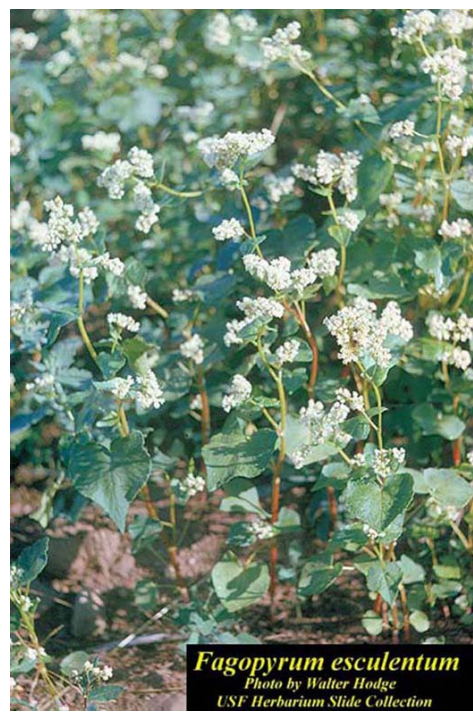
Figure 1. Commercially available buckwheat, F. esculentum.

In Japan, Russia, and northern China, buckwheat is an important cash crop and food source, with a substantial effort by researchers to develop more nutritious and pathogen-resistant varieties. In Manitoba, Canada, most buckwheat production is targeted for export to Japan for soba noodle production. Over 1.5 million hectares are